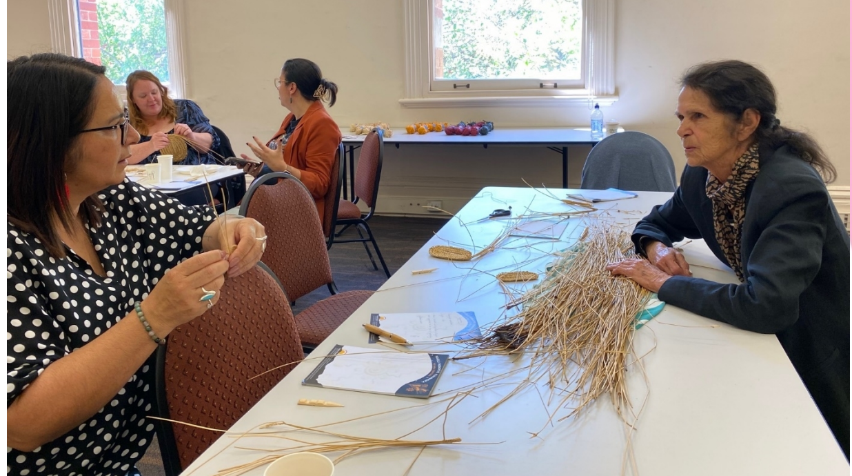
Image: Place of Reflection workshops at Tandanya National Aboriginal Cultural Institute.