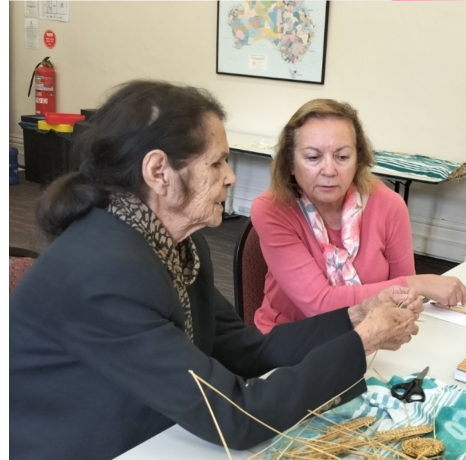
Image: Place of Reflection workshop at Tandanya National Aboriginal Cultural Institute.